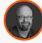
John Kindervag Chief Evangelist Illumio

Explore why Zero Trust has reached a critical tipping point, as AI accelerates threats and enables attackers of any skill level to operate with nation-state sophistication. This session will examine how agencies can move beyond incremental defenses to enforce segmentation, protect AI infrastructure, and build adaptive, antifragile architectures that contain breaches and strengthen over time.